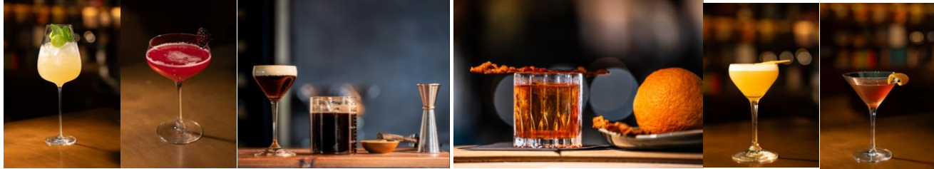
Cocktail Creations Featured at the Renaissance of American Spirits Mixology Event

In 2023, Hong Kong’s dynamic bar scene contributed eight award winning establishments to Asia’s 50 Best Bars. Leveraging this vibrant atmosphere, this year, ATO Hong Kong set up to bring U.S. distilled spirits to the forefront of Hong Kong’s top bartenders and hospitality sector. Partnering with Tasting Kitchen, a regional epicurian lifestyle publication, ATO reached out to the U.S. Distilled Spirits Council to collaborate in a series of unique promotional activities. A feature story highlighting the Renaissance of American Spirits , including interviews with U.S. distillers, was published this November. In addition to Hong Kong and Macau, this story is set to reach an audience of 500,000 affluent readers in Shanghai, Beijing, Guangzhou, Shenzhen, and Chengdu. The article is available in English , Simplified , and Traditional Chinese.