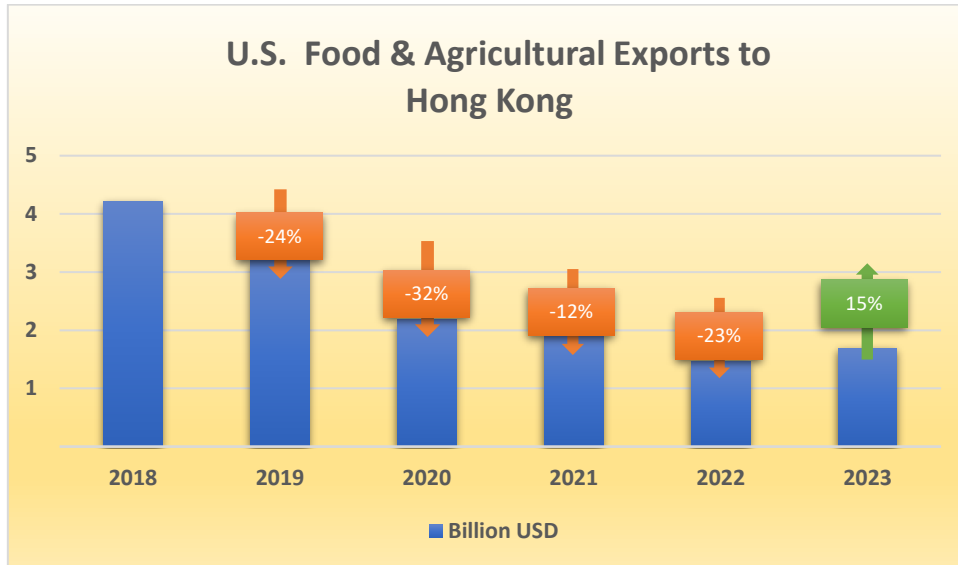
Data Source: U.S. Census Bureau Trade Data